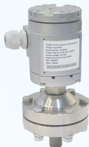
215T (type IV): isolating diaphragm type