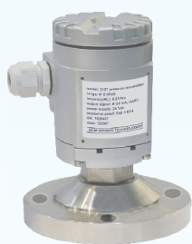
215T (type III): flange type