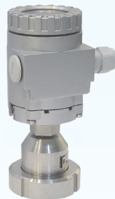
215T (type V): fast screw-in type