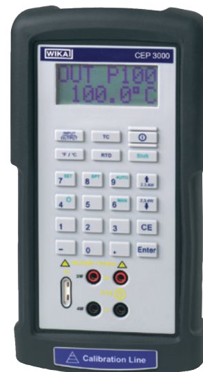
Hand-held temperature calibrator model CEP3000

There are a range of application possibilities for the CEP3000. It can be used for calibration in industry (laboratories, production, workshops), in calibration service companies and in quality assurance.