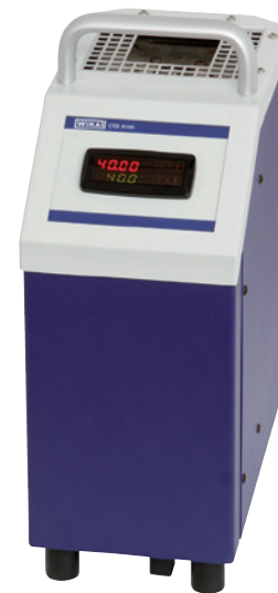
Temperature dry well calibrator CTD9100-650