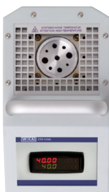
Model CTD9100-450 temperature dry well calibrator

Mains connector socket, power switch and fuse holder are located centrally at the front of the underside of the instrument.