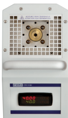
Model CTD9100-650 temperature dry well calibrator

The CTD9100-450 is used in the medium temperature range up to 450 °C. It generates its temperature with resistive electrical heating and features an enlarged insert with Ø 60 mm. Thus it is possible to calibrate several temperature sensors simultaneously or to calibrate thermometers with various diameters without having to change the sleeve.