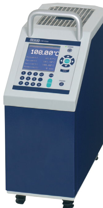
Model CTD9300 temperature dry well calibrator