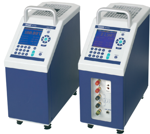
Model CTD9300 temperature dry well calibrators