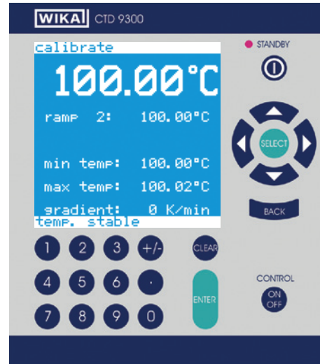
Measurement and calibration menu

With the measuring instrument, which can also be retrofitted into existing calibrators, Pt100, thermocouples and 0/4 ... 20 mA currents can be measured and converted into temperatures; and also in comparison with an external reference thermometer. Automatic calibrations are possible using a PC/laptop and the calibration software.